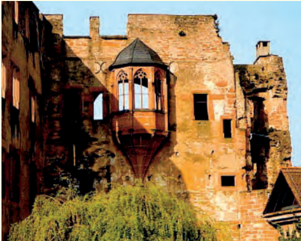
A bay window on the library building

The development of the residence from the early fortified castle to the impressive and prestigious residential palace still is visible in the ruins preserved. Take a glimpse into the daily life of the electors, servants and alets that used to live within these walls.