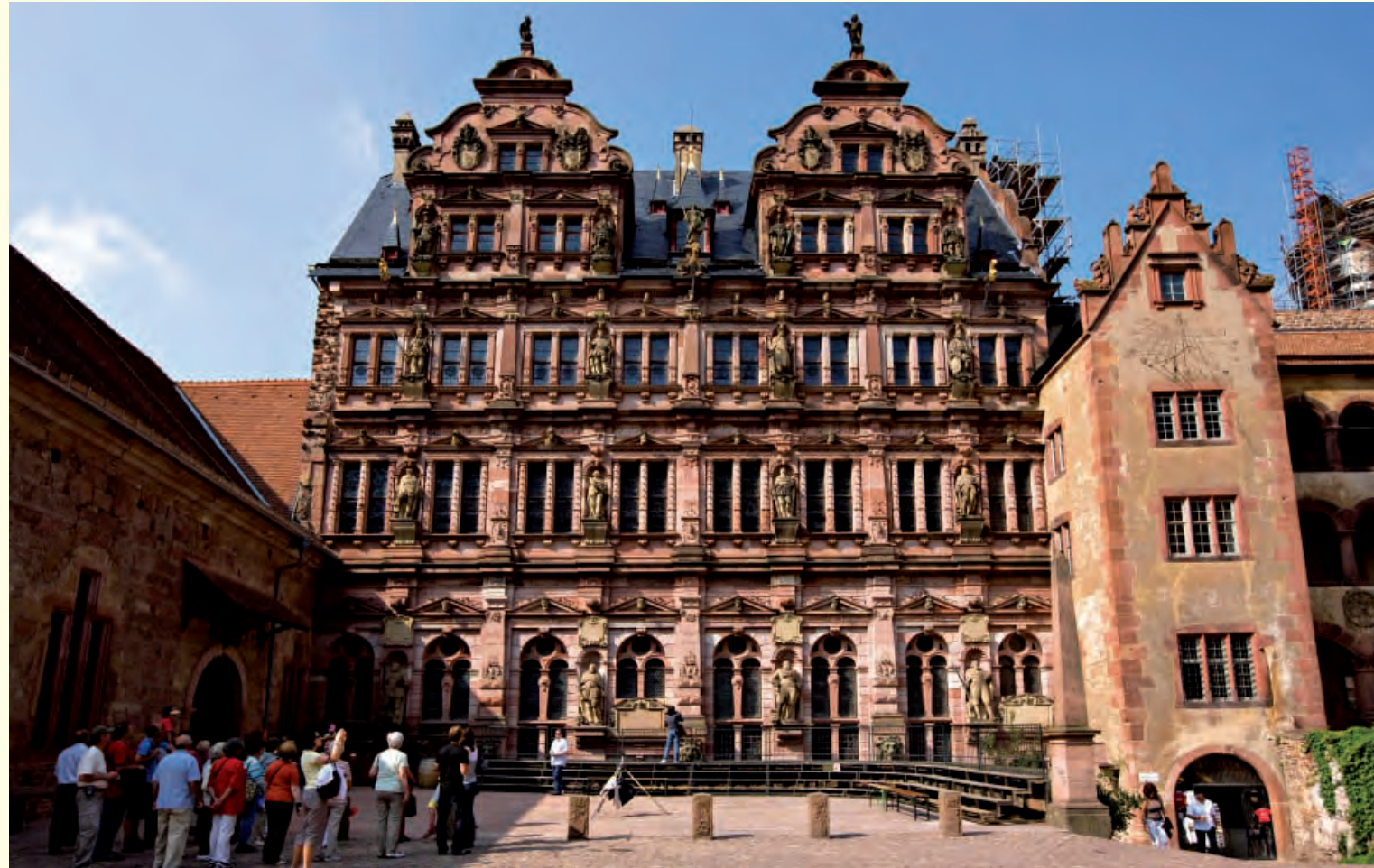
The Friedrich building

The war of succession put an end to the castle's heyday. Today, the romantic landscape of ruins is the focus of attention for visitors from all over the world. The castle garden, the "Hortus Palatinus", is more than just an extra item on the sightseeing agenda. In its day it was acclaimed as the eighth wonder of the world.